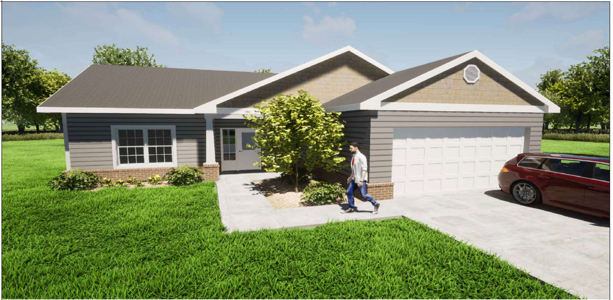
3-BR HOUSE ELEVATION