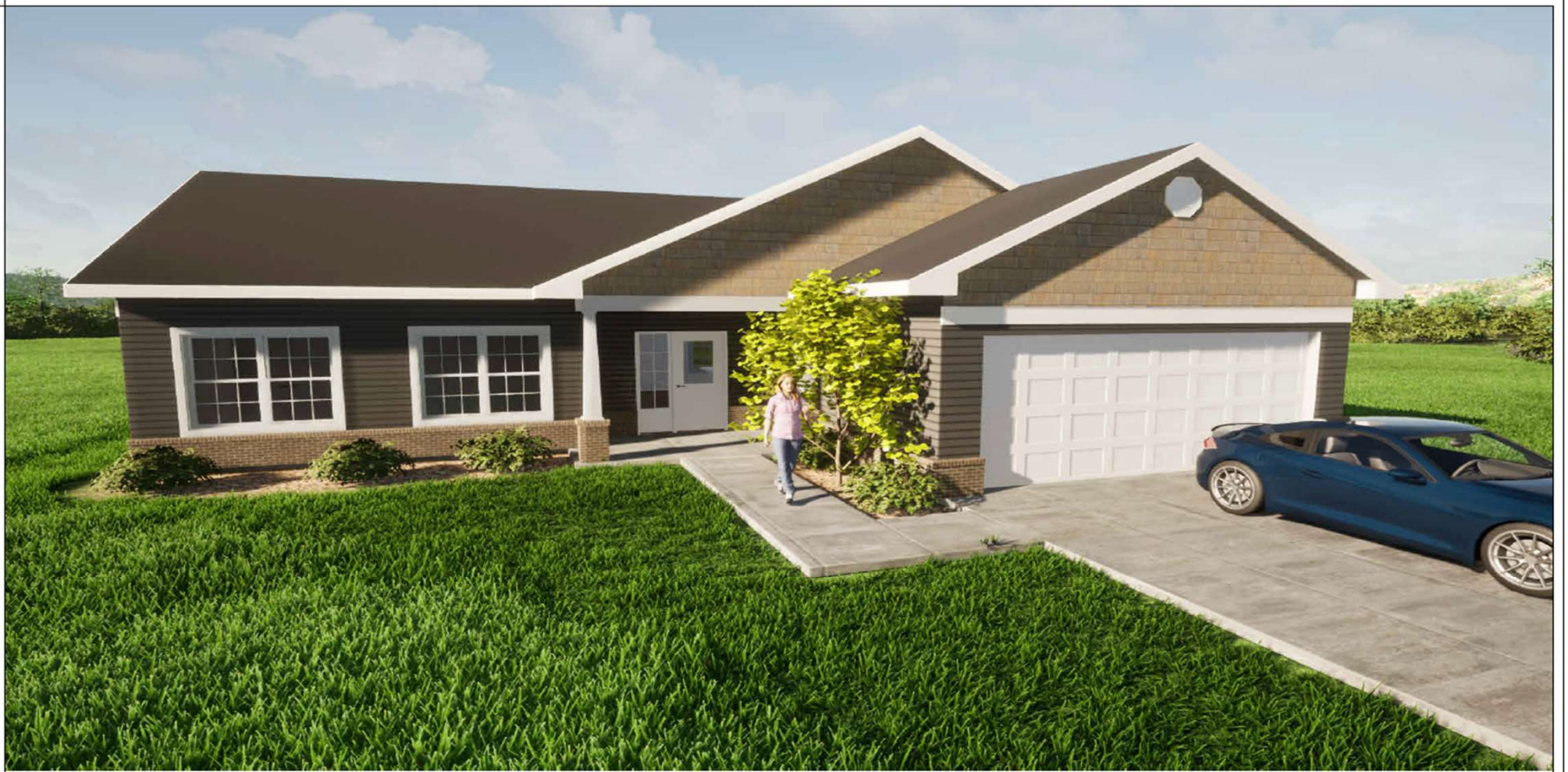
4-BR HOUSE ELEVATION