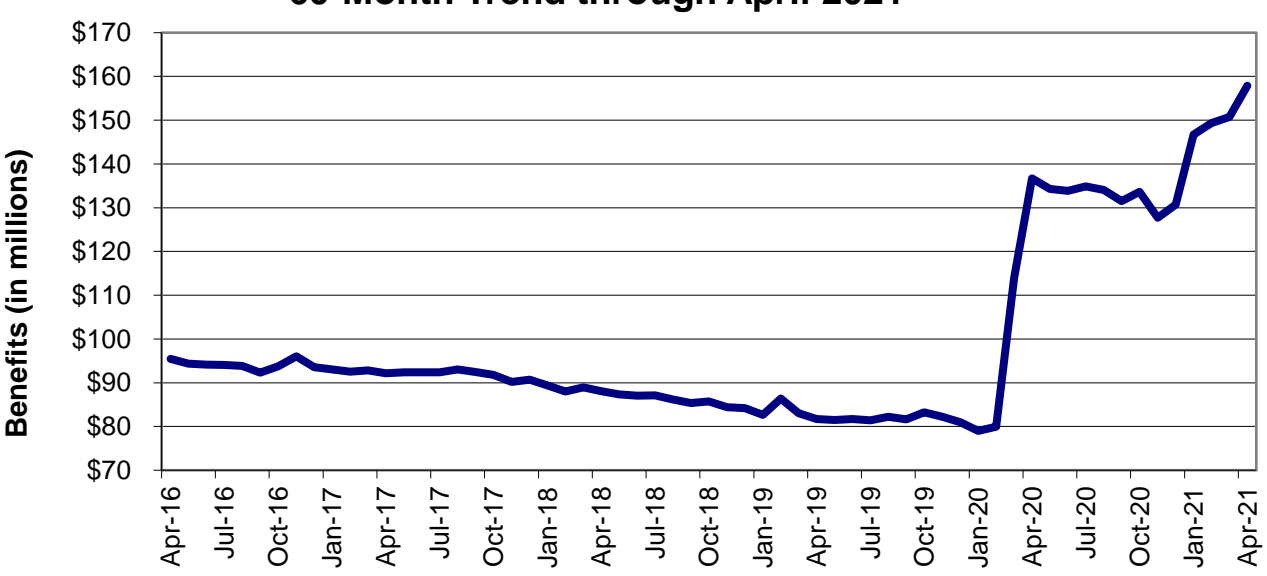
Figure 7 Food Stamp Benefits 60-Month Trend through April 2021