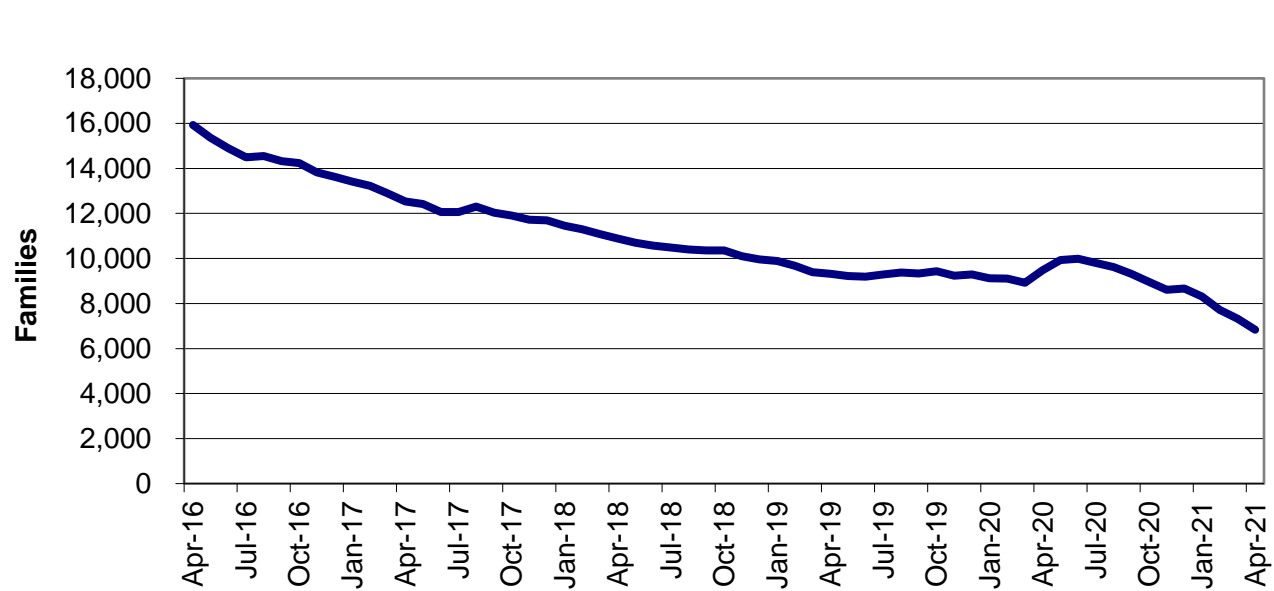
Figure 2 Temporary Assistance Families 60-Month Trend through April 2021