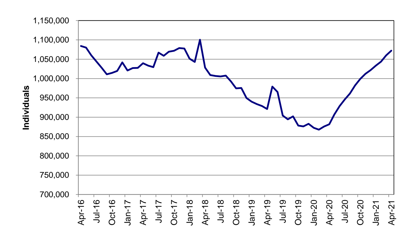
Figure 4 Missouri MO HealthNet Recipients 60-Month Trend through April 2021