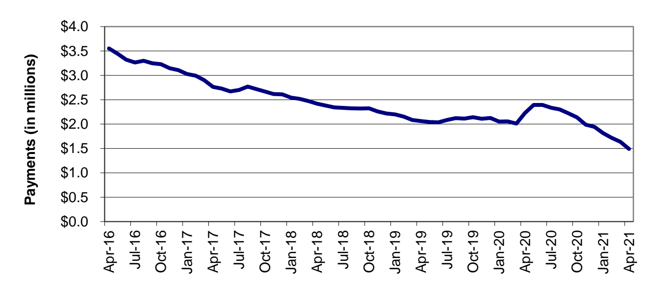
Figure 3 Temporary Assistance Payments 60-Month Trend through April 2021