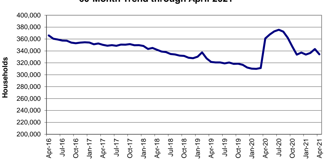
Figure 6 Food Stamp Households 60-Month Trend through April 2021