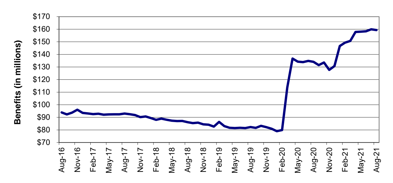
Figure 7 Food Stamp Benefits 60-Month Trend through August 2021