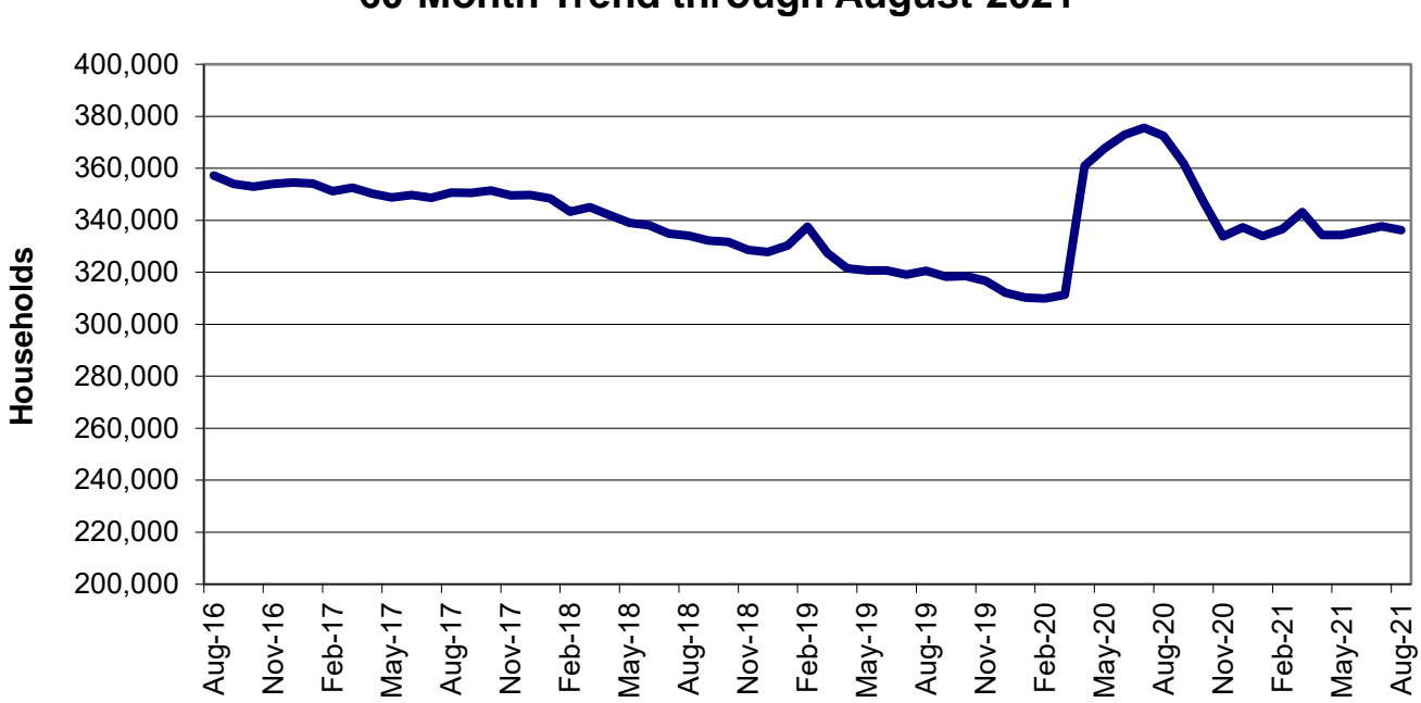
Figure 6 Food Stamp Households 60-Month Trend through August 2021