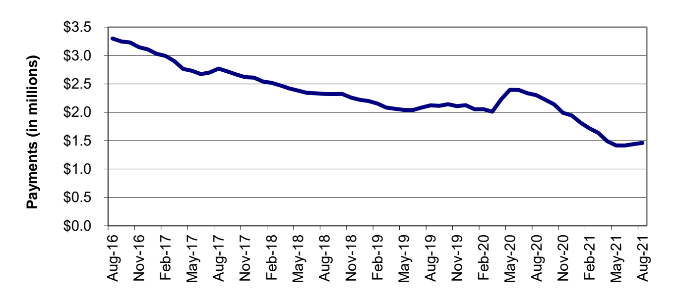
Figure 3 Temporary Assistance Payments 60-Month Trend through August 2021