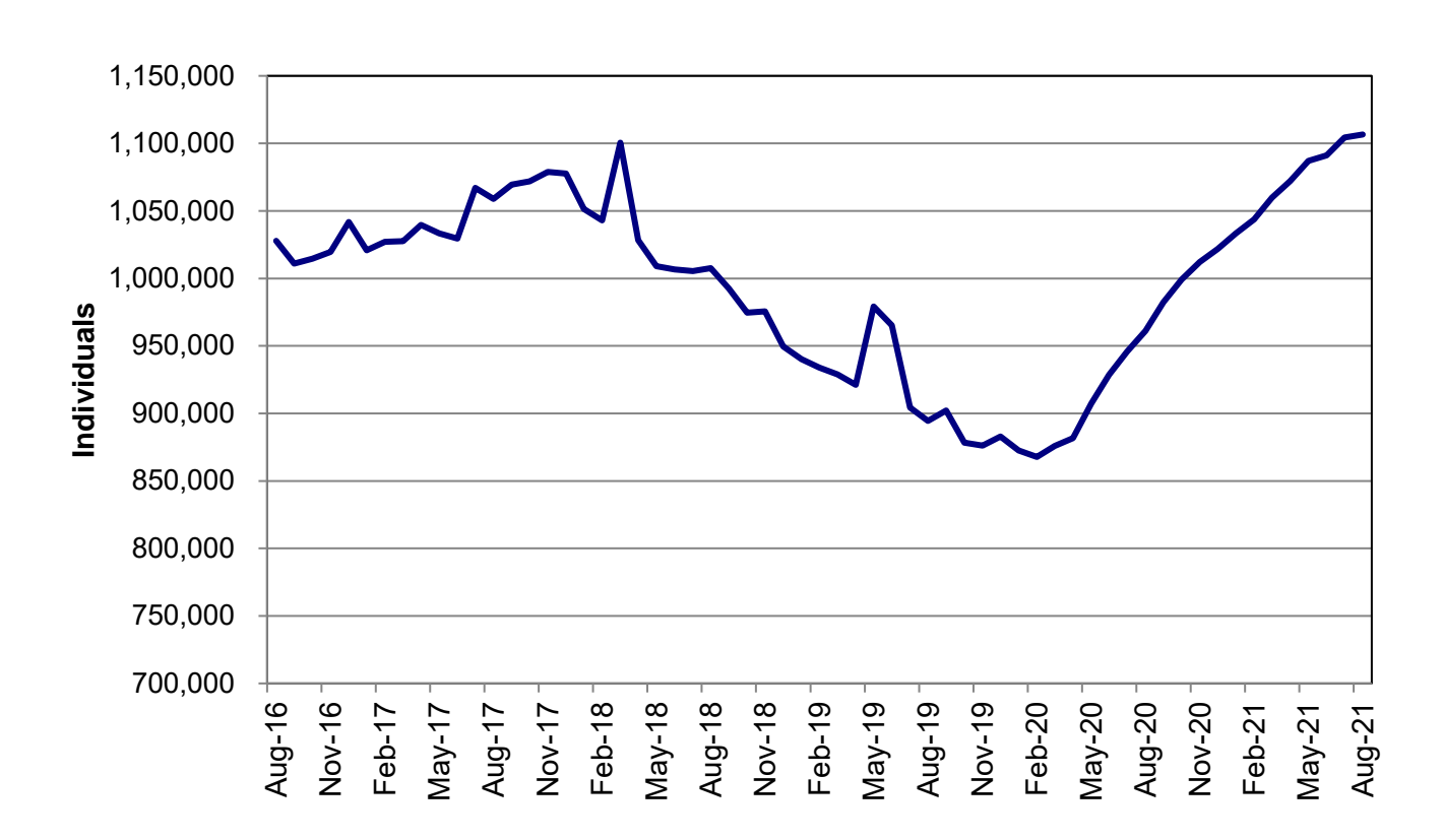
Figure 4 Missouri MO HealthNet Recipients 60-Month Trend through August 2021