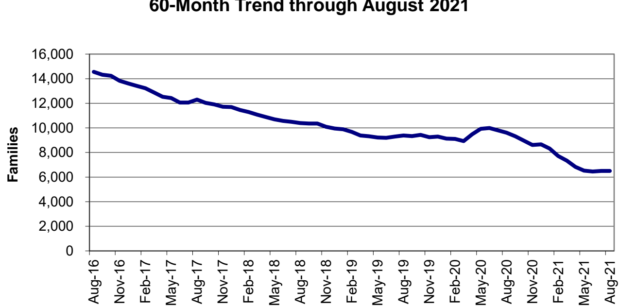
Figure 2 Temporary Assistance Families 60-Month Trend through August 2021