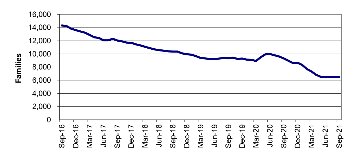
Figure 3 Temporary Assistance Payments 60-Month Trend through September 2021