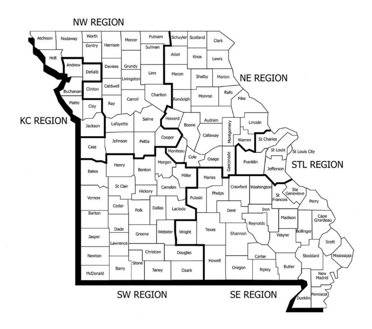
Figure 1 Department of Social Services Regions