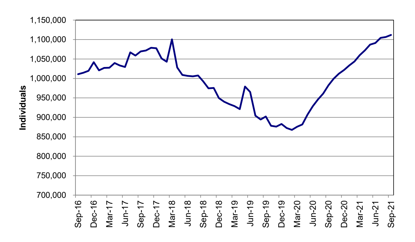
Figure 4 Missouri MO HealthNet Recipients 60-Month Trend through September 2021