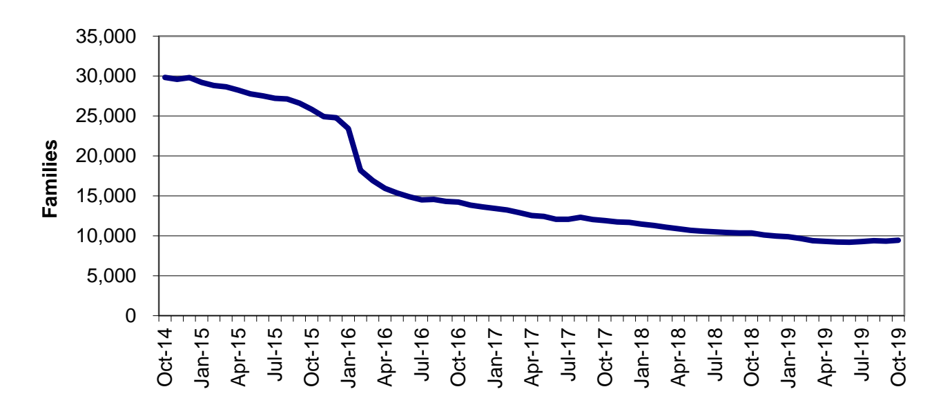
Figure 3 Temporary Assistance Payments 60-Month Trend through October 2019