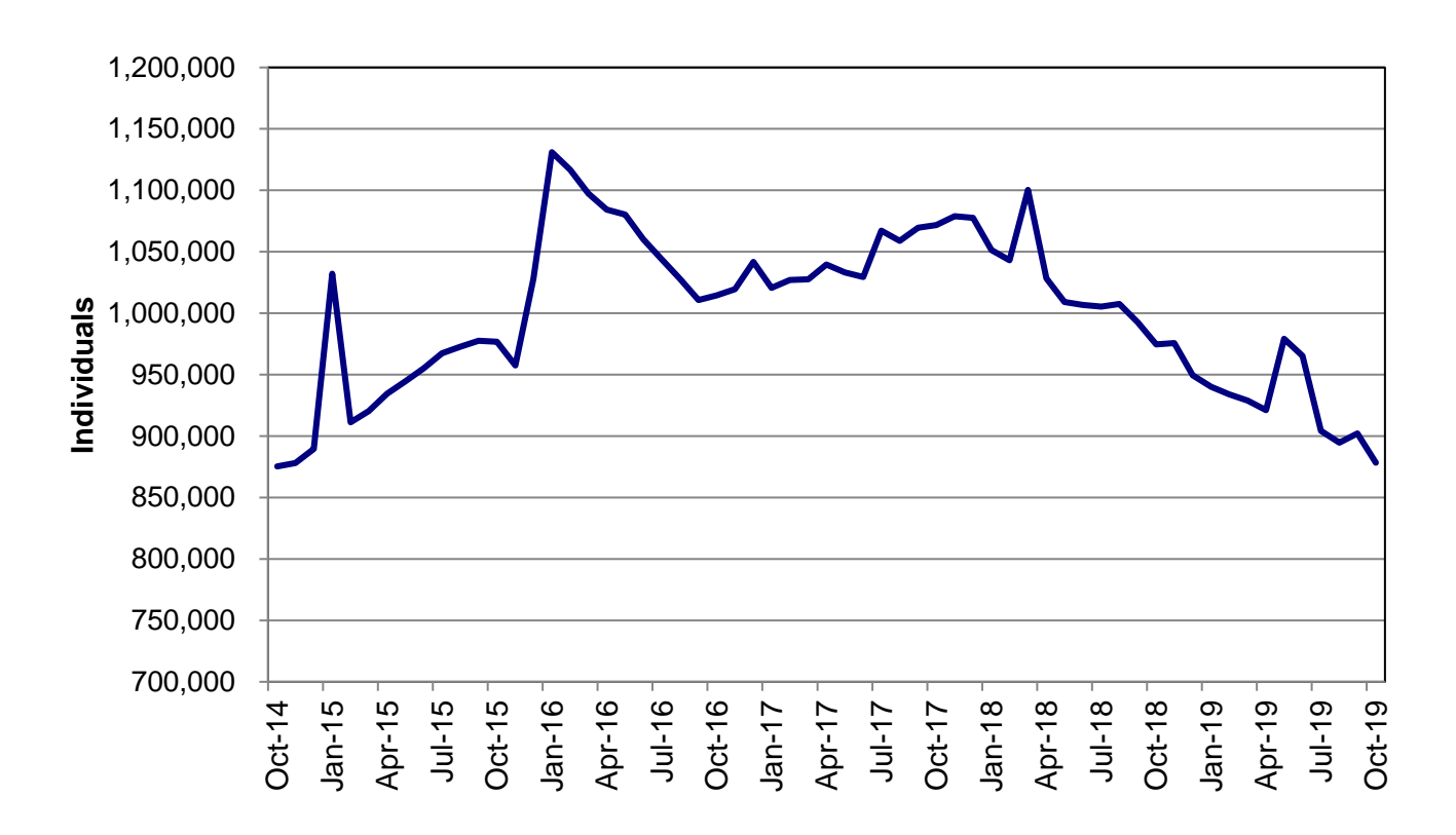
Figure 4 Missouri MO HealthNet Recipients 60-Month Trend through October 2019